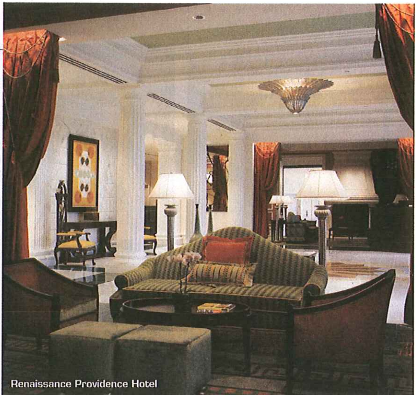
Renaissance Providence Hotel

rious suites. This Rhode Island tradition maintains every bit of glamour and elegance that it had during the Roaring Twenties. The hotel just completed a $14 million renovation to restore its original allure while offering modern-day amenities like a Red Door spa, Starbucks, and McCormick & Schmick's restaurant. 11 Dorrance St., Providence, 401-421-0700, providencebiltmore.com